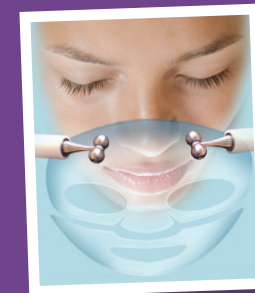
CACI HYDRATONE MASK - electrically conductive silicon gel mask

20 MINS PER TREATMENT COURSES OF 5 OR 10 AVAILABLE (SUBJECT TO FREE CONSULTATION)